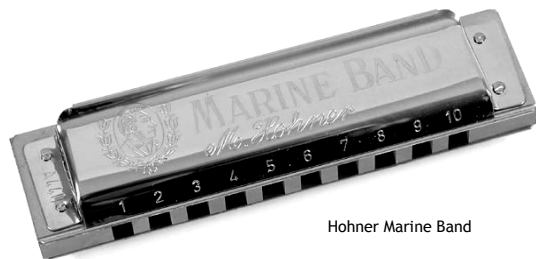
Hohner Marine Band

The bottom octave was tuned for chordal accompaniment in the tongue blocking style, and the melody was played out of the right side of the mouth in the middle and upper octave. To extend the range, the upper octave reversed the breathing pattern. The iconic harmonica that incorporated these qualities was the Hohner Marine Band, released in 1896.