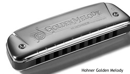
Hohner Golden Melody

You can instantly see from the diagrams that the POWERBENDER presents a simpler, steamlined picture to achieve the same result. Playing it is much simpler too..